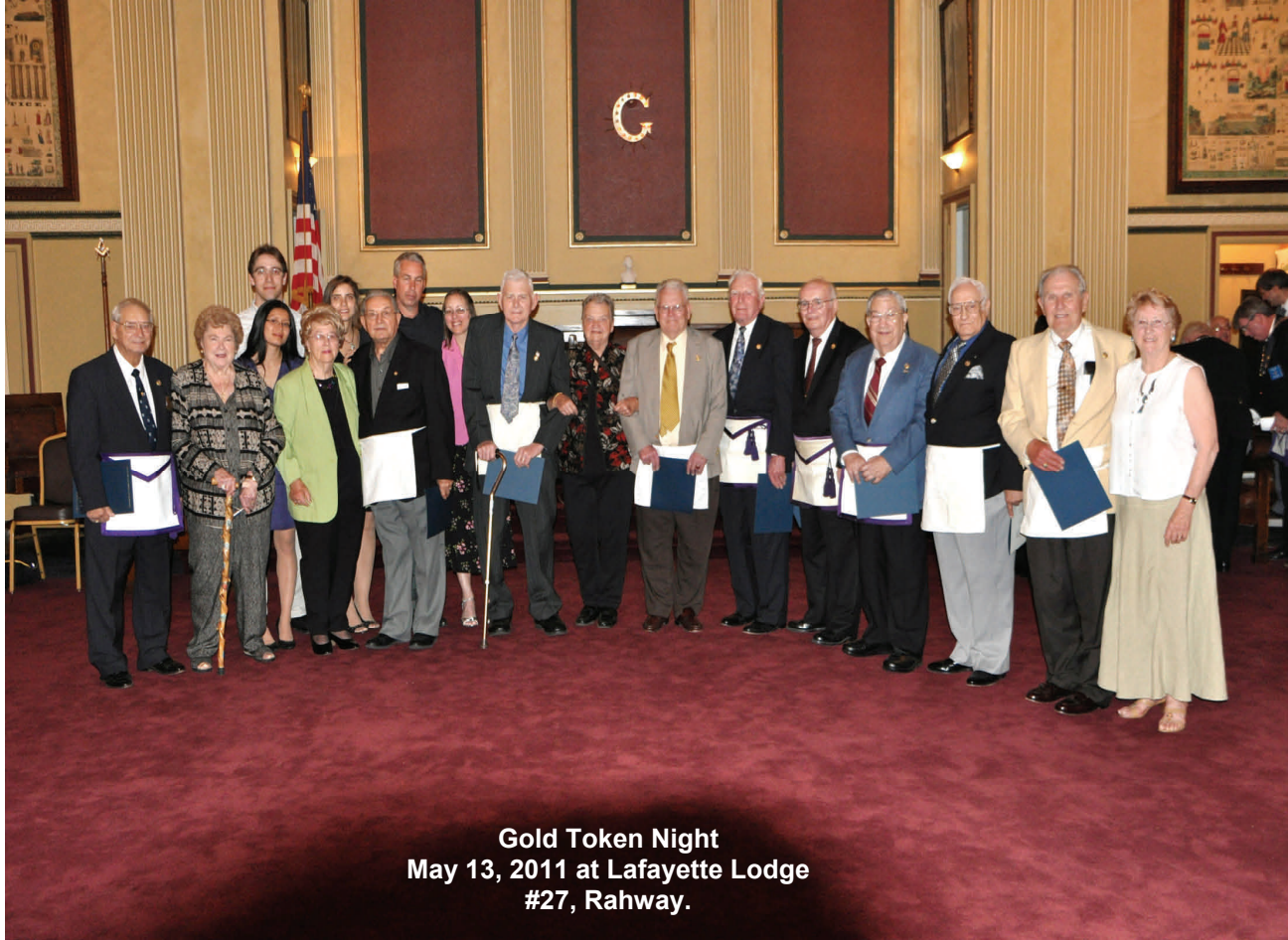
Gold Token Night May 13, 2011 at Lafayette Lodge #27, Rahway.