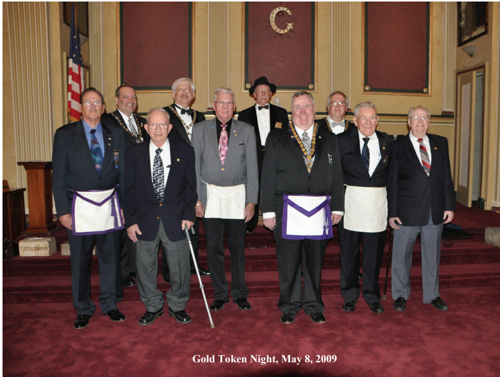
Gold Token Night, May 8, 2009